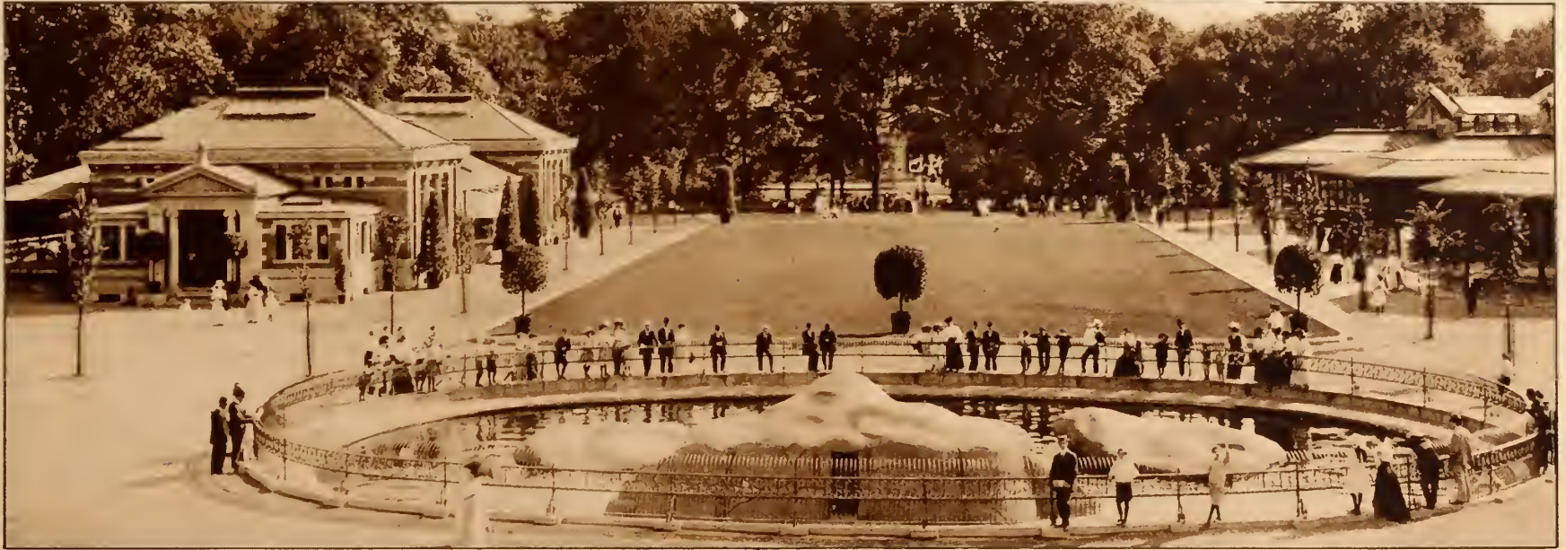
HOME OF THE SEALS, in New York Zoological Garden.